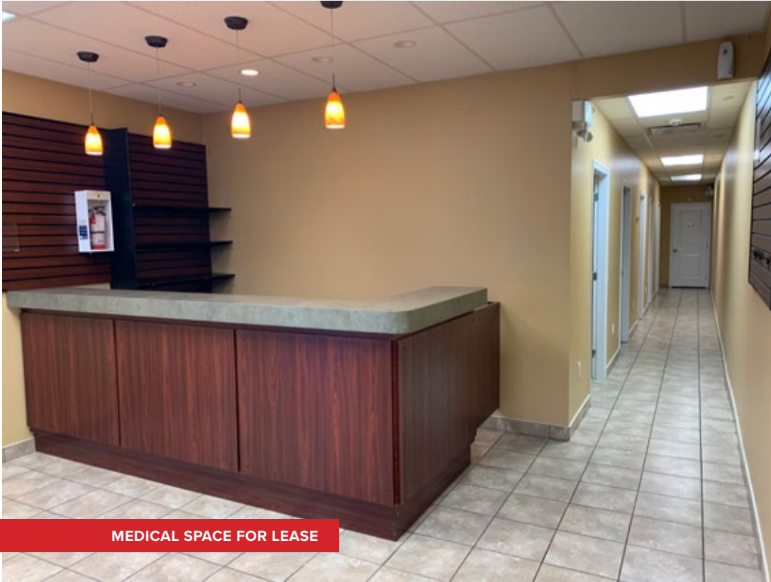
MEDICAL SPACE FOR LEASE