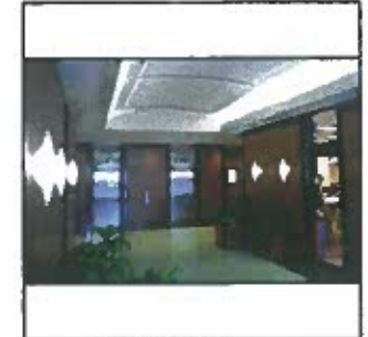
MAIN FLOOR LOBBY VIEW

PREPARED FOR: District Realty Corporation, Brokerage ADDRESS: 200 Elgin St., Ottawa, ON DATE: October 20, 2011 REVISION: n/a PROJECT NUMBER: 100308 DRAWING SIZE: 8.5" x 14" - Legal Size